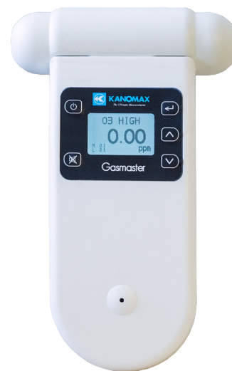
Gasmaster Handheld Gas Monitor