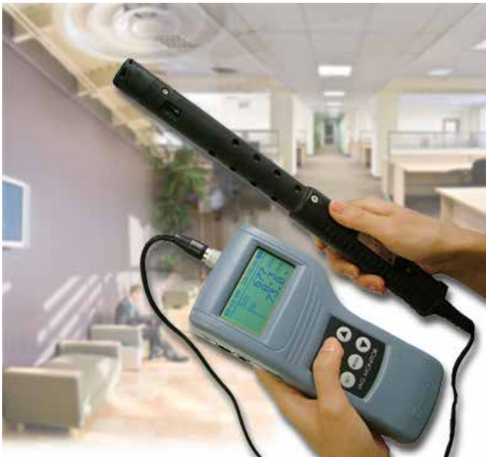
Model 2211 Handheld IAQ Monitor

When we think of indoor air quality many people think of controlling the temperature and eliminating toxins such as carbon monoxide, and it is true that these two parameters are important factors, but they are only part of IAQ. Humidity is large factor in how comfortable a building's occupants feel and can lead to complaints of it being too hot or cold, even when the temperature is set at the correct level. The comfort zone chart is a useful tool for determining acceptable levels for humidity and temperature based on the season.