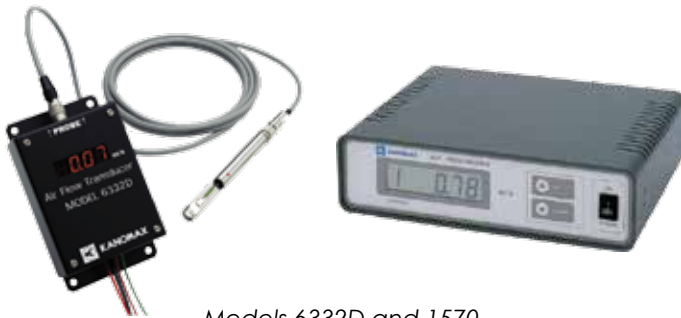
Models 6332D and 1570

When you order this product you will need the base unit, between 1 to 4 probes, and 1 cable for each probe you order. The probes do not have to be the same type and the cables can also be of varying lengths to suit your needs (standard cables range from 2 to 30 meters).