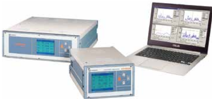
Models 1550 and 1560

Deciding which product is right for your application is relatively easy.