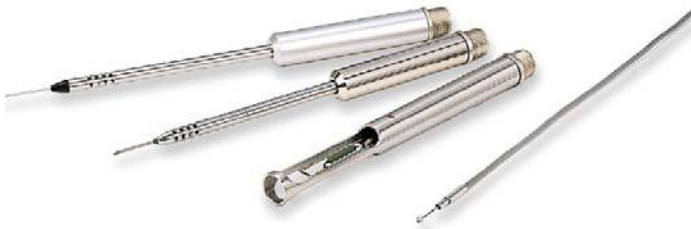
Four common types of hot-wire probes

Kanomax has extensive experience creating hot-wire anemometers to measure airflow in a wide variety of circumstances. In fact, the number of options we've added to our catalog over the years can be bewildering to new customers or to someone suddenly assigned to a project that requires accurate measurement of airflow. Sometimes even industry veterans don't fully understand the different options available to them. If either of the preceding two sentences sounds like it may apply to you don't worry! You're in the right place to get help understanding what the different options are and which is best for your application.