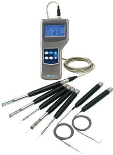
Climomaster shown with all the available probes

If you're still not sure which probe is right for you, give us a call at 973-786-6386 or send us an email at info@kanomax-usa.com and we'll be happy to help you find the right probe for your application. We're always happy to hear from you and help you find the right solution for your problem.