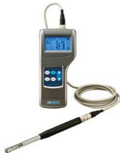
Handheld Thermal Anemometer

The second common type of ventilation system is non-laminar or turbulent airflow. In this case the room is designed to dilute and remove contaminants based on a certain # of air exchange rates per hour. To check this type of system you would measure the airflow at both the supply and the returns and then calculate the number of air exchanges that occur per hour (as noted in the design specifications for the room).