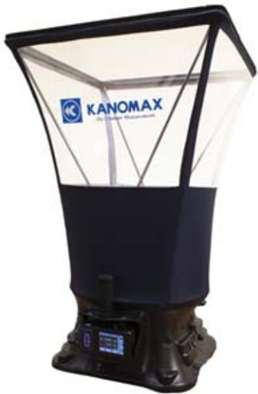
Airflow Capture Hood

A number of tools are available to help with these measurements. Thermal or vane-type anemometers as well as capture hoods can be used. However if the flow rate in the clean room is low (usually 0.2 to 0.5 m/s) it is best to perform these measurements with an anemometer due to the limitations of technology for airflow capture hoods.