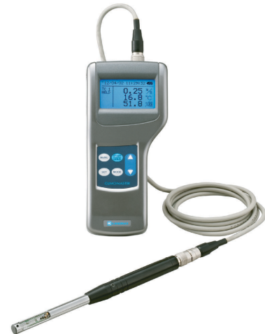
Climomaster™ Model 6501